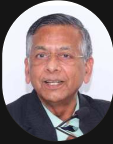
Mr. R. Venkataramani Attorney General of India