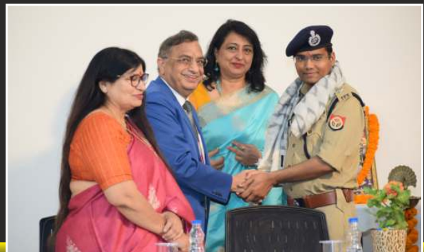
International Symposium on Remaking Criminology: Contemporary Insights from the Criminal Justice System, 2023