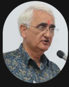
Mr. Salman Khurshid Senior Advocate, Supreme Court of India