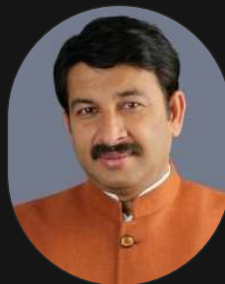
Mr Manoj Tiwari Member of Parliament North East Delhi