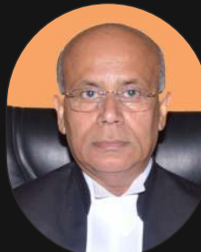
Hon'ble Mr. Justice Navin Sinha Former Judge Supreme Court of India