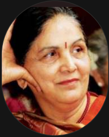
Hon'ble Ms. Justice Gyan Sudha Misra Former Judge Supreme Court of India