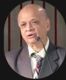
Hon'ble Mr. Justice Arijit Pasayat Former Judge Supreme Court of India