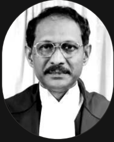
Hon'ble Justice C.T. Ravikumar Judge Supreme Court of India