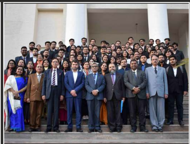
National Conference on Genesis to Terminus of Article 370: Socio Legal Perspectives 2020