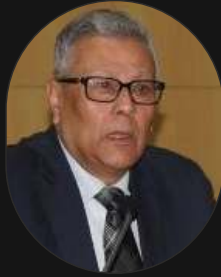
Hon'ble Dr. Justice Mukundakam Sarma Former Judge Supreme Court of India