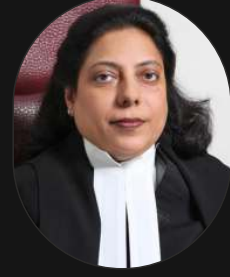
Hon'ble Ms. Justice Mukta Gupta Former Judge High Court of Delhi