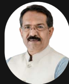
Mr Harsh Malhotra Minister of State in the Ministry of Corporate Affairs and Ministry of Road Transport & Highways