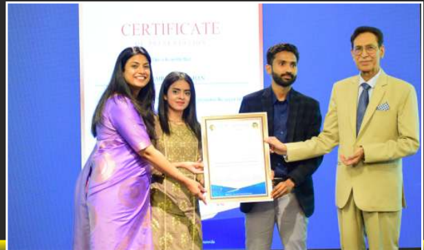
International Conference on Championing Inclusivity: Interdisciplinary Perspectives on Disability Rights and Social Justice, 2024