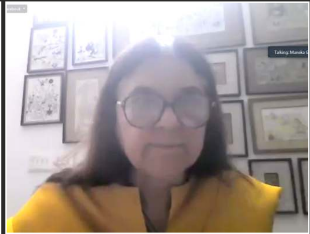
International Conference on Deliberations on Rethinking the Environment: Sustainability in the Modern Era, 2022