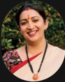
Ms Smriti Irani Former Union Cabinet Minister