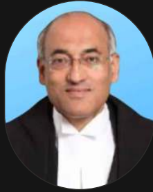
Hon'ble Mr. Justice Najmi Waziri Former Judge High Court of Delhi