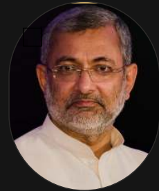
Hon'ble Mr. Justice Kurian Joseph Former Judge Supreme Court of India