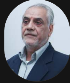
Mr M.C. Mehta Renowned Public Interest Litigation Attorney