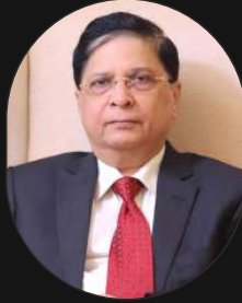
Hon'ble Mr. Justice Dipak Misra Former Chief Justice of India