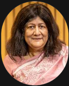
Hon'ble Ms. Justice Indira Banerjee Former Judge Supreme Court of India