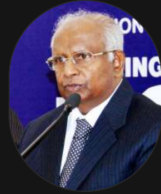
Hon'ble Mr. Justice K.G. Bala Krishnan 37th Chief Justice of India and Former Chairperson, NHRC