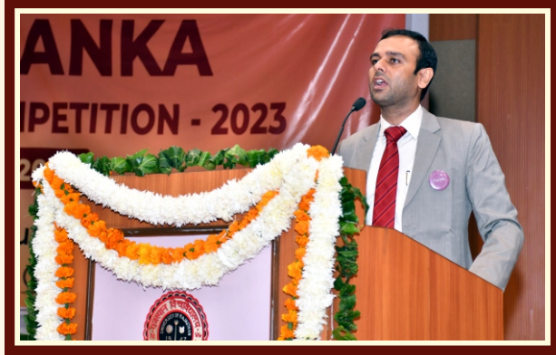
11 th UFYLC RANKA NMCC INAUGURATION