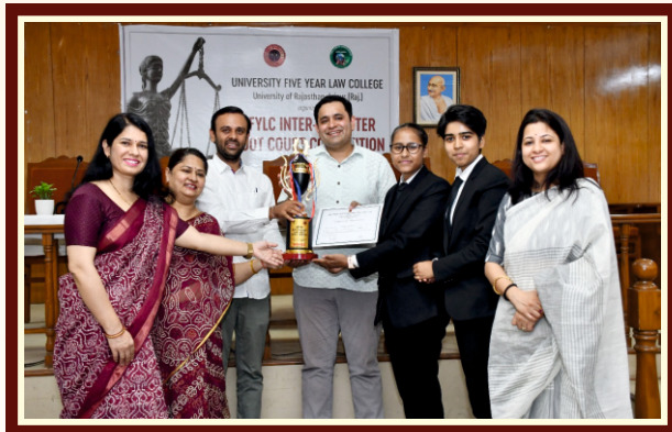
UFYLC ISMCC 2024