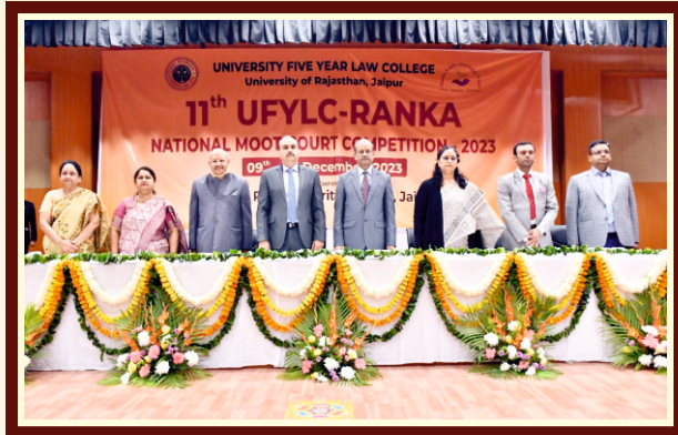
11 th UFYLC RANKA NMCC INAUGURATION