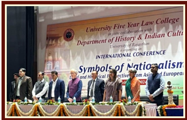
INTERNATIONAL CONFERENCE ON "SYMBOLS OF NATIONALISM"