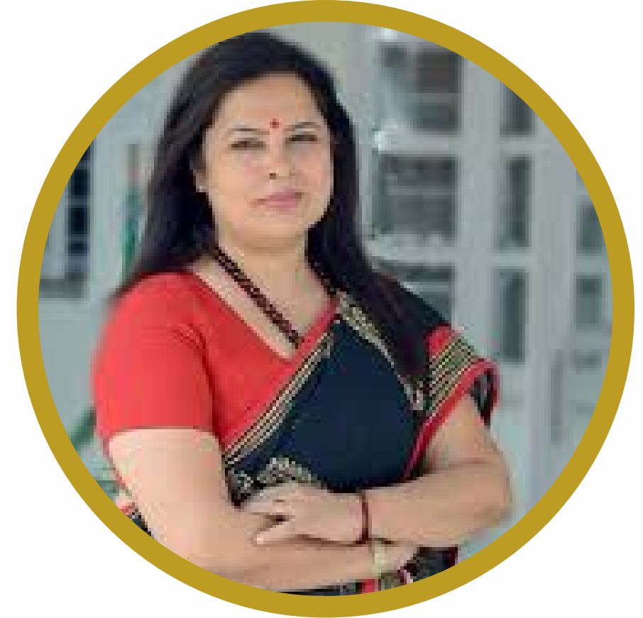
Special Guest of Honour Ms. Meenakshi Lekhi Senior Advocate Former Minister of State for External Affairs Government of India