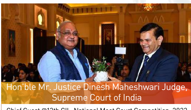
Chief Guest @13th GIL National Moot Court Competition, 2023