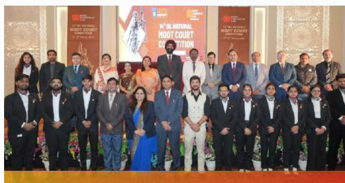
14th GIL National Moot court competition, 2024