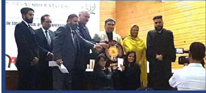
Our Students Winners at University of Kashmir (2018)