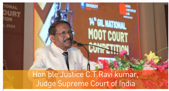
Chief Guest @14th GIL National Moot Court Competition, 2024